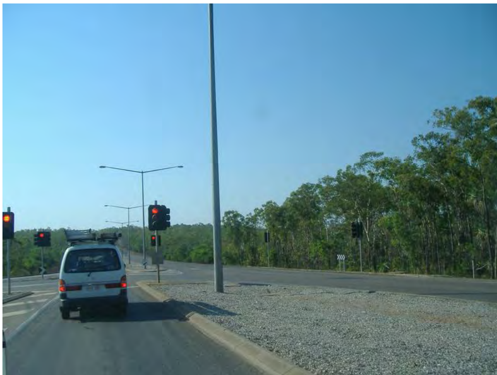
Road to Palmerston