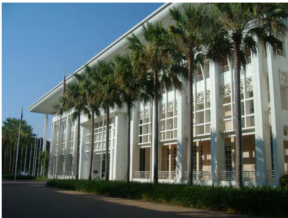
Northern Territory Parliament Building