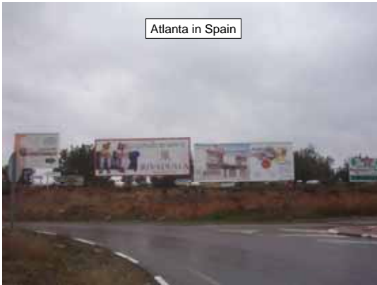
Atlanta in Spain