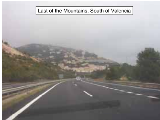
Last of the Mountains, South of Valencia