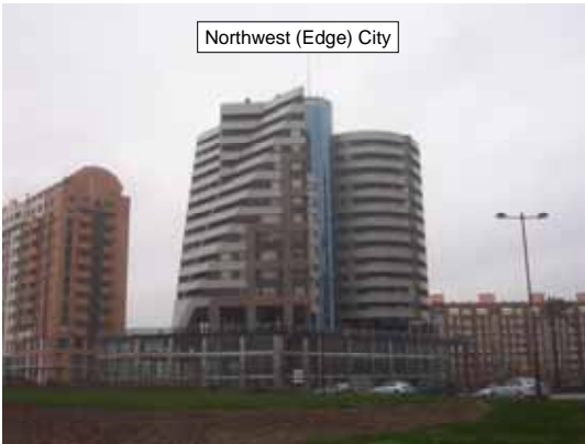
Northwest (Edge) City