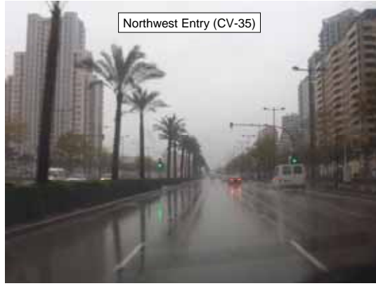
Northwest Entry (CV-35)