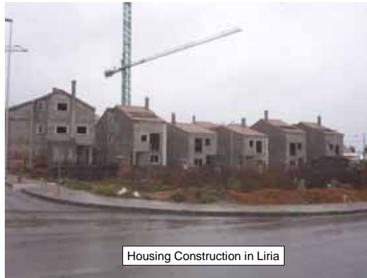
Housing Construction in Liria